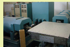
3D Vibration Table