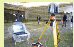
3D Laser Scanner