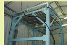
Artificial Rainfall Machine